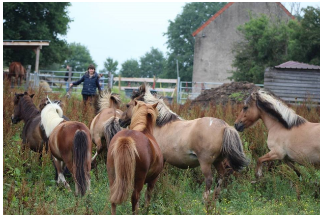
HORSES LIVE ALL YEAR ROUND

You will expect the unexpected in one of the best attraction park in Europe