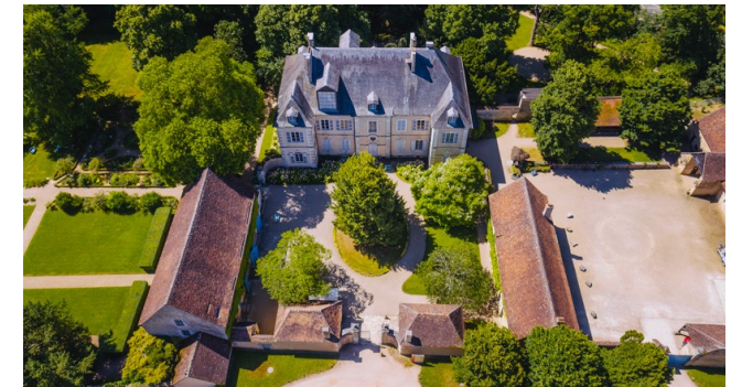
Georges SAND Domaine in NOHANT