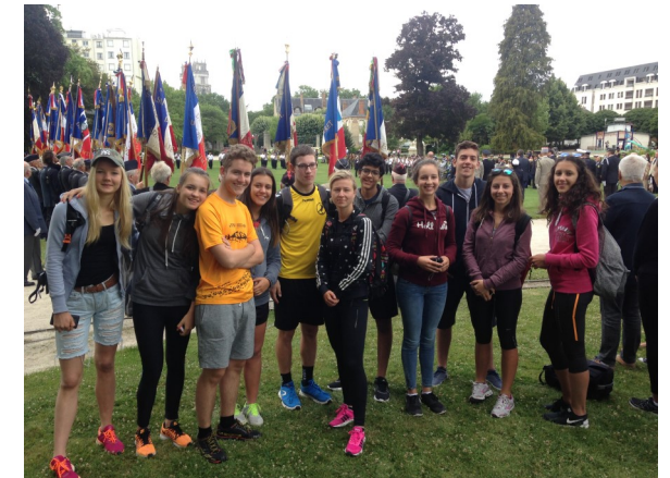
STUDENTS AND BASTILLE DAY IN CAMP 2016