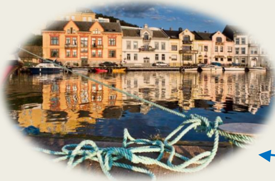
3. Farsund (13-17 August)