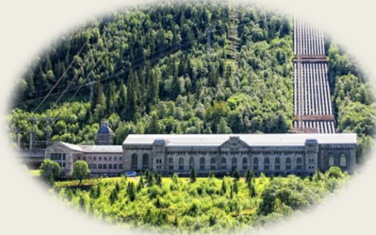
2. Bø (9-13 August)